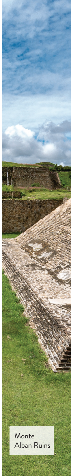
Monte Alban Ruins

Explore a village whose tradition of producing high-quality woven goods dates back to ancient times. Enjoy hands-on chocolate making + craft activities.